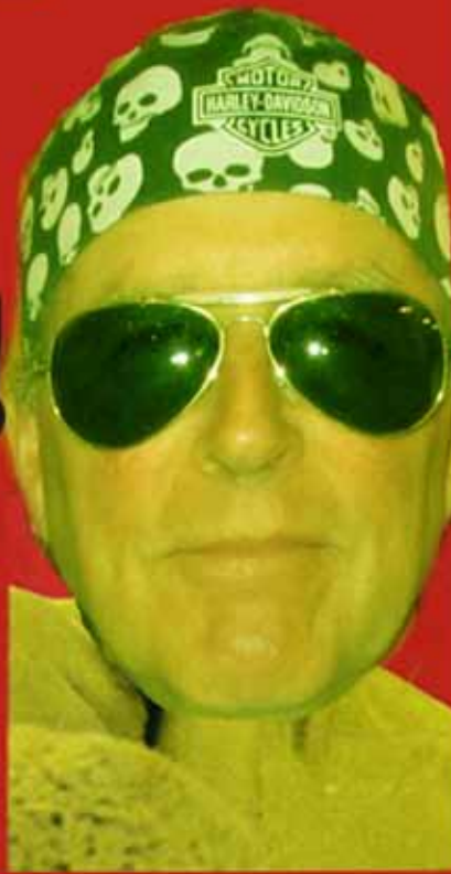
his gaze alone will kill you